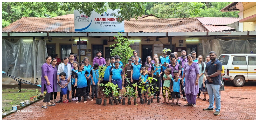
World Environment Day