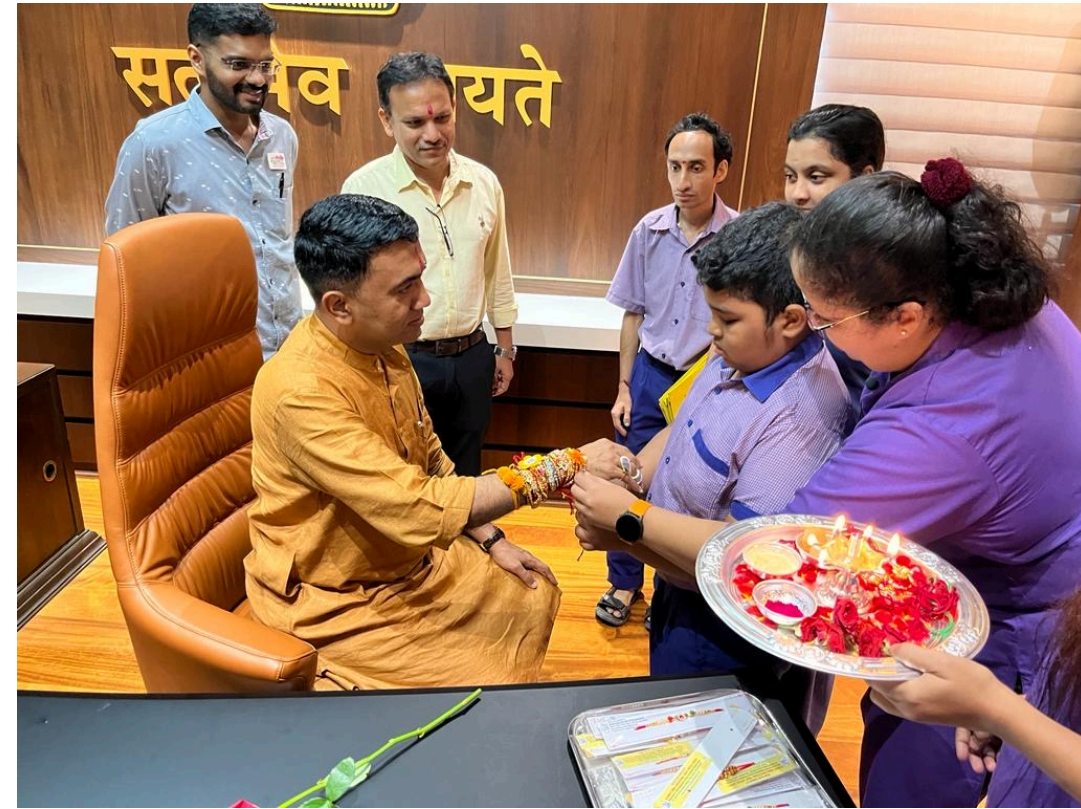
Raksha Bhandhan Celebration with the Chief Minister of Goa