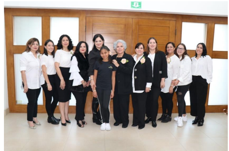
FEMALE HONORARY COUNCIL