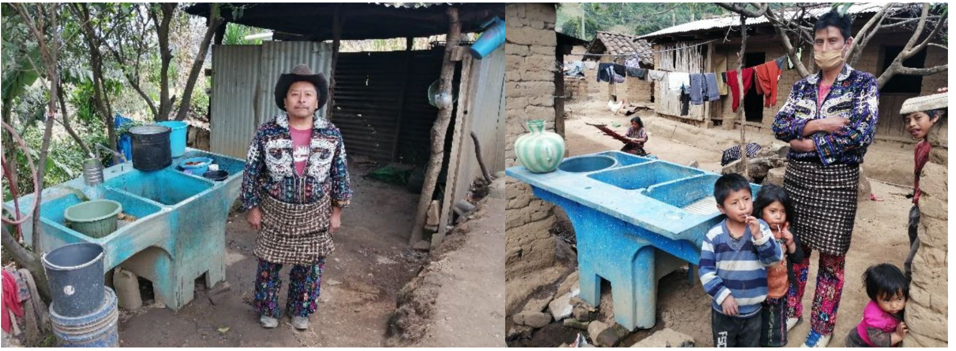
Host Sponsor: Rotary E-Club of Lake Atitlán-Panajachel International Sponsor: Rotary Club of Fort Collins